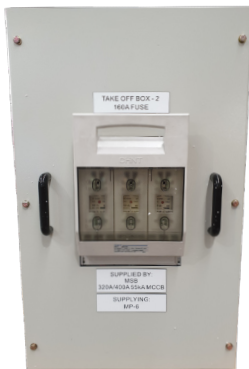
Take Off Box