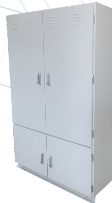
Group Metering Panels