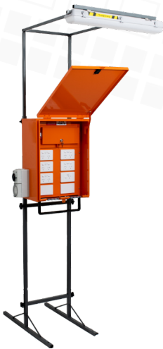
Temporary Power Board