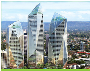
Residential High-Rise Apartments

Design Switchboards and Distribution has built a reputation for quality and reliability. We are experts in our field, and we can design and manufacture of LV power distribution electrical switchboards for your next project.