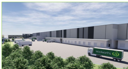
Large Industrial Warehouse and Distribution Centers