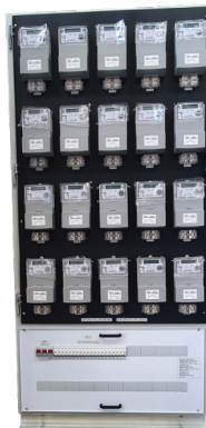
Riser Meter Panels