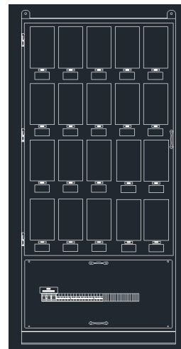
Part No -RMP-C Enclosure 950Wx2020Hx250D Ingress Protection: IP40 20 Single Phase 12 Three Phase