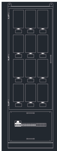
Part No -RMP-A Enclosure 650Wx2020Hx250D Ingress Protection: IP40 12 Single Phase 6 Three Phase