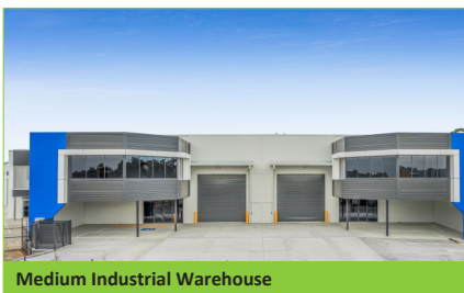
Medium Industrial Warehouse