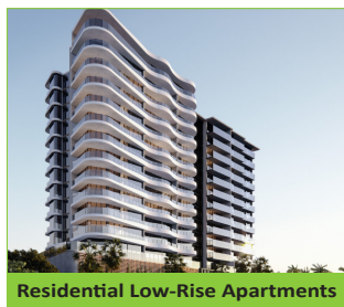
Residential Low-Rise Apartments