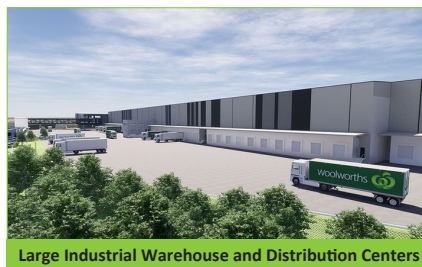
Large Industrial Warehouse and Distribution Centers