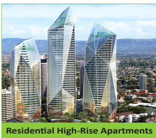
Residential High-Rise Apartments